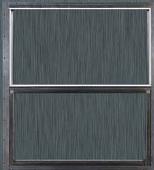
15 x 21