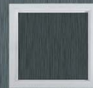
10 x 10 Square