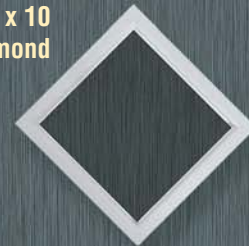
10 x 10 Diamond